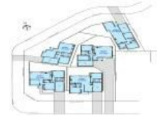
FLOOR PLAN - D2. 1:100 at A3